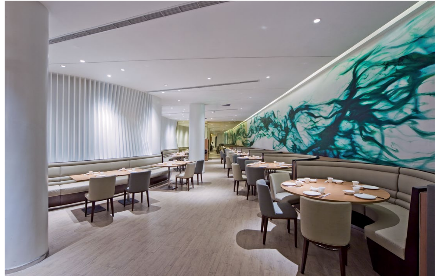
The powerful blue ink feature refers to the famous tidal bore of the Qiantang River