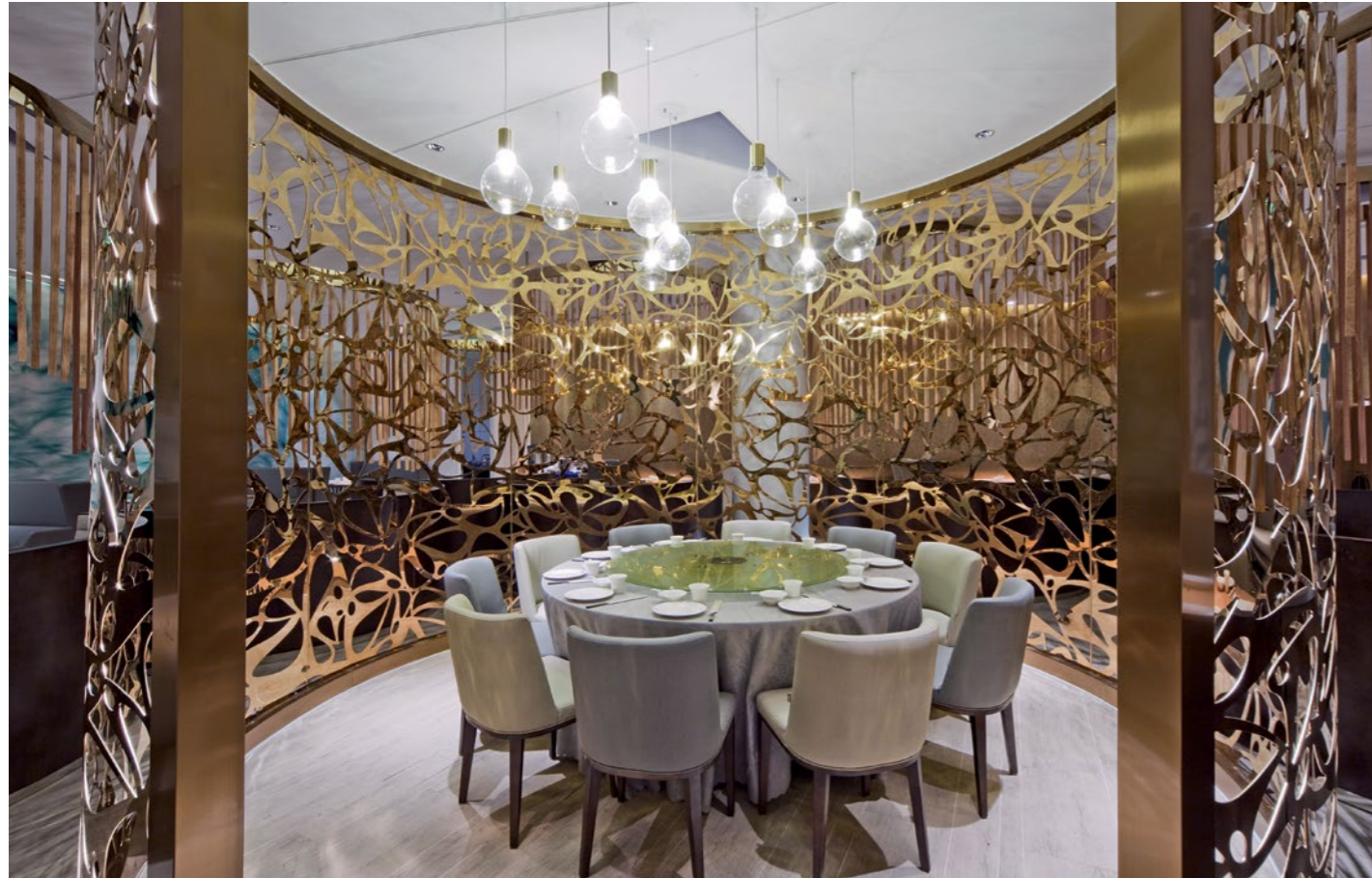
The VIP table is surrounded by booth seating and an exquisite laser-cut brass screen

The inter-connected open dining areas are defined by a white, curvy feature wall, which signifies the sense of movement of a flying butterfly, and breaks the rigidity of the triangular site. Opposite this is the dining space's main wall, graced by powerful wavy movements of blue ink spanning its full length. Meanwhile, various circular booths are configured to surround the VIP table, giving a focal point in the open dining areas.