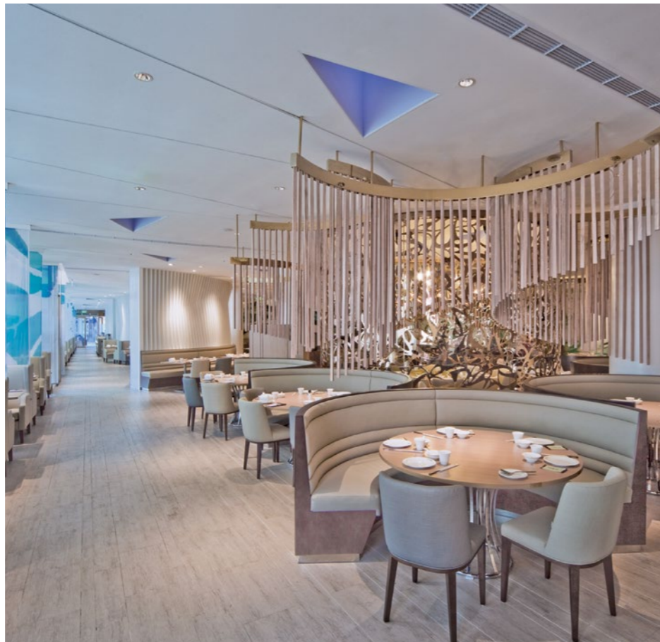
The open dining space with various seating configurations

In order to offset the white ceiling and walls, the firm utilised beige-toned dining chairs and timber flooring to give warmth to the environment. The ceiling also features numerous triangular skylights in different orientations and sizes, to bring in extra natural light during day-time and help generate a comfortable dining experience.