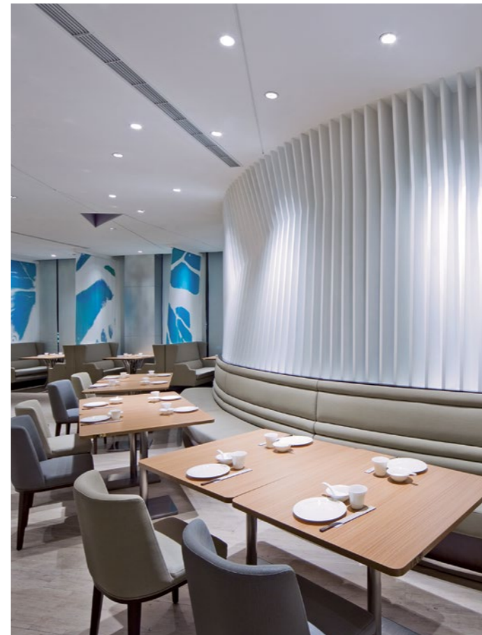
The dining areas are defined by a curvy feature wall